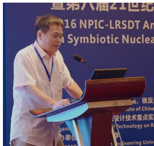
Fig.4 Prof. Su Guanghui.

stressed that CFD technology will play more important role in the design and safety assessment of nuclear systems.