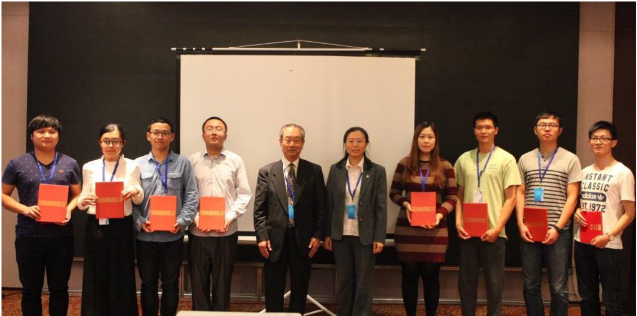
Fig. 2 Group photo of attendants of the best student paper award giving ceremony.