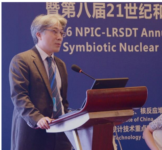
Fig.5 Prof. Kang.

and the future work will mainly focus on practically eliminating the possibility of large radioactive releases, accident tolerance fuel research and design optimized.