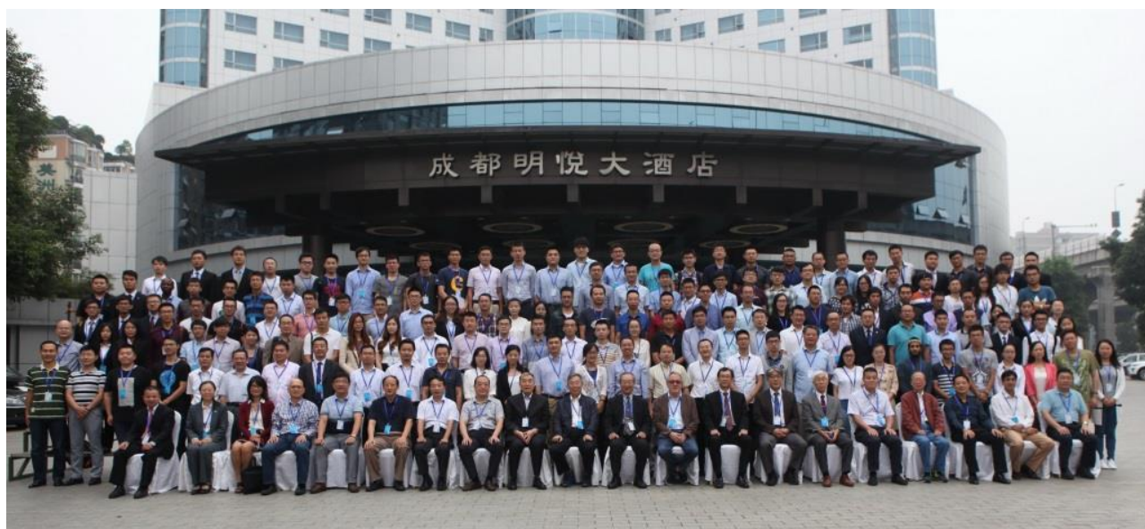
Fig. 1 Group photo of all participants of ISSNP2016.