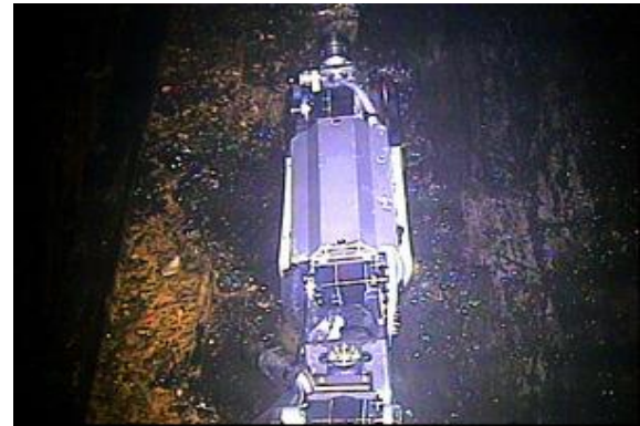
Fig. 1 The Sasori (Scorpion) robot is stuck inside the containment vessel of No. 2 reactor of Fukushima Daiichi nuclear power plant.

decommissioning project may take longer than originally expected.