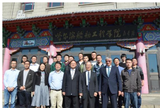
Photo 1. Group photo of all attendants.