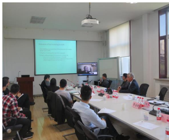
Photo 2. Snapshot of the workshop room.