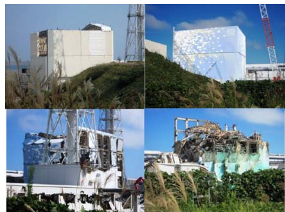
Fig. 2 Appearance of No.1 to No.4 reactor buildings (clockwise from left top).

Received date: March 12, 2012 (Revised date: March 22, 2012)