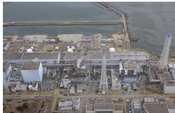
Fig. 1 Bird's eye view of the Fukushima Daiichi NPS after the accident.

This article presents the fourth and last report in this series, and discusses the aftermath of the Fukushima Daiichi accident as observed from December 1, 2011 to March 11, 2012. It complements the first, second and third articles, which reported the updates from March 11, through May 31, 2011, from June 1 through August 31, 2011, and from September 1 through November 30, 2011, respectively. The contents of this last update deal in particular with the announcement of the Mid-and-long-Term roadmap, the various social