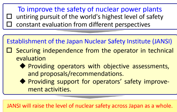
Fig. 1 Mission of JANSI.

This activity must be continued “tirelessly”. This is one of the ideas that every Japanese nuclear industry participant will have to provide objective reviews from the outside. Accordingly, all the members of the Japanese nuclear industry including electric utilities, decided to establish an independent organization that has advanced engineering capability and discernment into nuclear safety and can make scientific and technical judgments without being affected by the specific intentions of electric utilities. This is why the independent JANSI was established with the cooperation of the whole Japanese nuclear industry. Figure 1 summarizes the objectives and activities of JANSI in order to raise the level of nuclear safety across Japan as a whole.