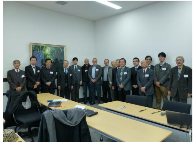
Photo 2 Group photo of all participants