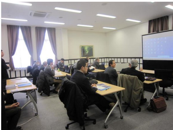
Photo 1 A scene of the workshop room